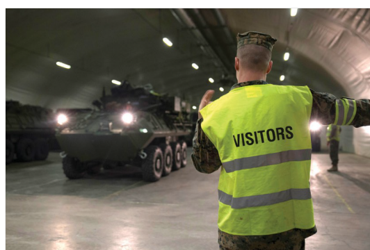
Interior routes for ground and air vehicles