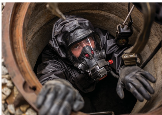
Tunnels that can be damaged and rubble