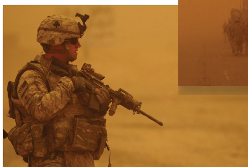
Line of sight considering obscurants and atmospheric conditions