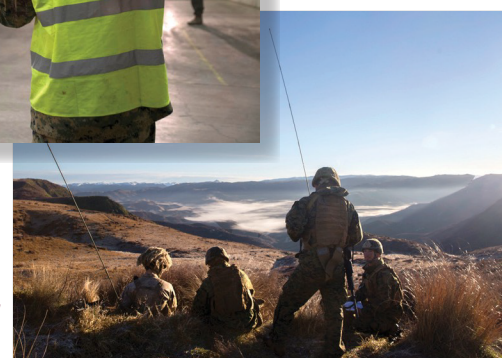
Route and location placement with terrain contour considerations